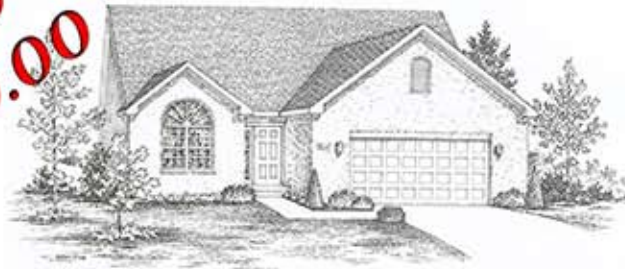
Beech 1728 sq ft Three Bedroom Ranch

Show Special SAVE $16,900 Now $189,900.00